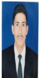
Anand Nautiyal Taj Hotel & Resort, Rishikesh (Housekeeping)/ Sky Gourmet Flight Catering, Hyderabad (Food Production)