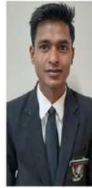
Pradeep Mishra Meuse Business & Luxury Hotel, Nasik (Food Production)/ SkyGourmet Flight Catering, Hyderabad (Food Production)