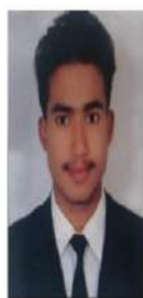
Manjeet Rana Meuse Business & Luxury Hotel, Nasik (Housekeeping) / SkyGourmet Flight Catering, Hyderabad (Food Production)